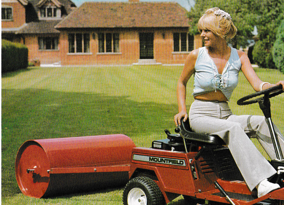
36" Lawn Roller Heavy duty welded steel tank type lawn roller weighs up to 400 lbs when filled with water.

And using a Mountfield Ride-on really is fun – your wife might even have the job finished before you get home from work. You will certainly never have trouble finding volunteers to cut the grass – older children will compete for the privilege.