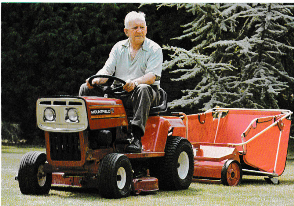
30" or 36" Lawn Sweepers For collecting grass cuttings or leaves. Sweeping height is adjustable from the driver's seat. Convenient rear dumping.

Two Wheel Dump Truck Empty this handy dump cart from the driver's seat – transport leaves, grass cuttings, garden rubbish etc. Extension sides will double capacity.